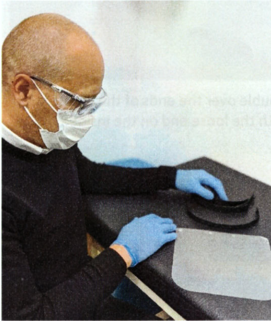
Protective Face Shields are supplied in kits