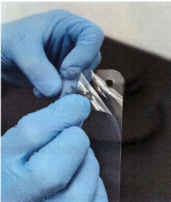
Remove protective film from both sides of PET visor shield