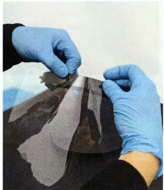
Locate visor holes over two centre location lugs, hold in place