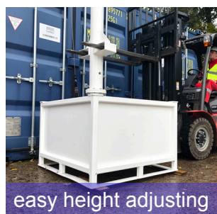
easy height adjusting