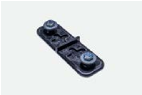
2-way Standard Connector

A durable plate with pre-set bolt holes suitable for 2-way or 4-way connection. Simply align the mats over the connector and secure from the top using bolts and washers. This is our most versatile and user-friendly option, allowing for fast, straightforward installation while providing a strong, reliable connection.