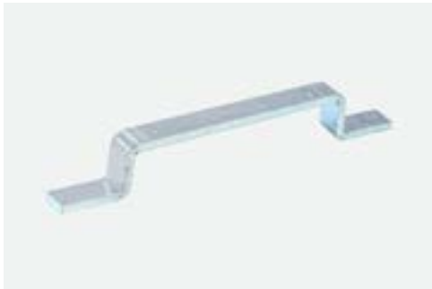
2-way Galvanised Connector

A heavy-duty, corrosion-resistant connector available in both 2-prong and 4-prong configurations. The prongs insert through the pre-drilled holes, locking the mats together without the need for bolts or washers. This provides a quick and tool-free method of joining mats.