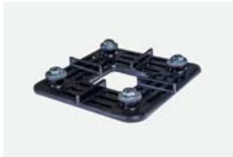
4-way Standard Connector