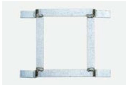
4-way Galvanised Connector