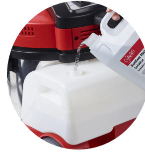
Solution of choice is placed in removable 7ltr fluid tank