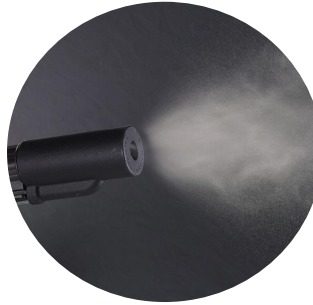
Fluid is expunged at high power, through a unique diffuser nozzle to form droplets