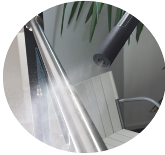
Solution formulated to cling to surface as droplets, which are then active against germs.