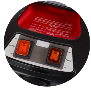
Switch motor and pump on at simple to use switchboard