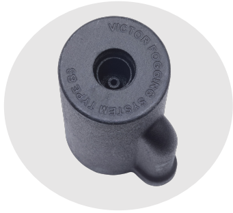
Press fluid release trigger on handgun