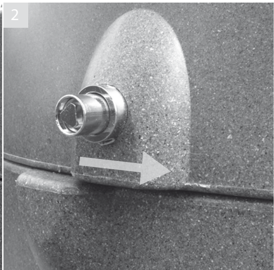
Twist bin top anticlockwise until it stops