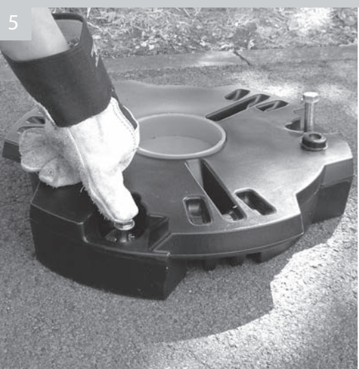
Drill 12mm holes in the three marked positions Re-position the cartridge over the drilled holes. Using a mallet drive bolts home Add washers to bolts and push through holes in cartridge locating into drilled ground holes