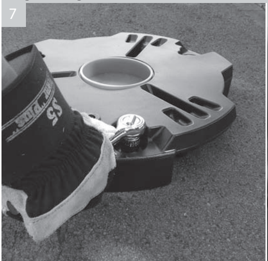
Use socket to tighten bolts, tighten to 22.0Nm torque for concrete. Tightening the bolts will