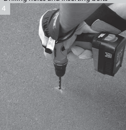
to a depth of 100mm to accommodate the bolt length, remove debris from holes