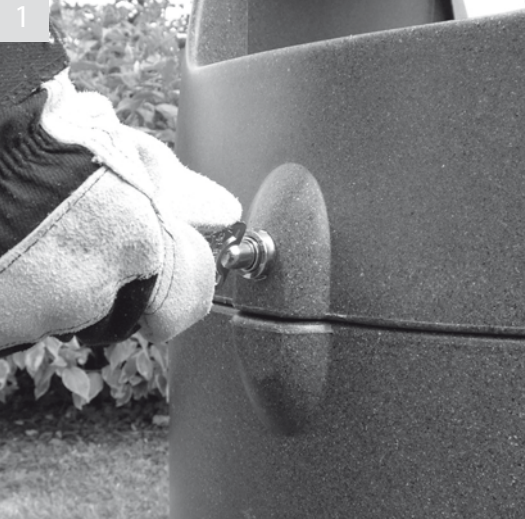
Insert key and turn clockwise until stop. Lock will pop out and release