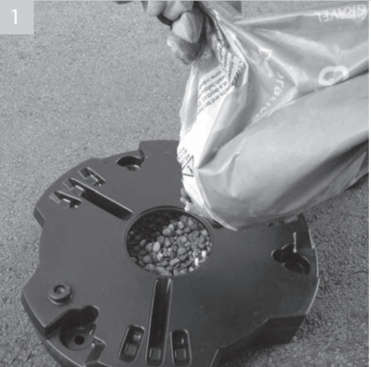
Remove cap and Pour gravel into the cartridge equally disperse gavel across the ballast cartridge fill to 30mm from top, replace cap