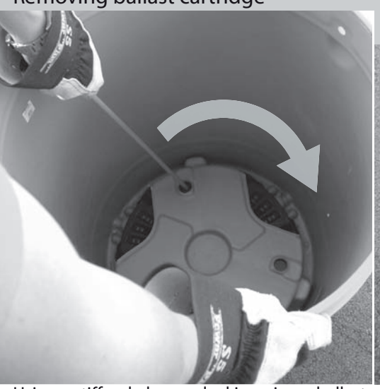
Using a stiff rod, depress locking pin on ballast cartridge, whilst pushing down twist bin body anti-clockwise, rotate until bin is free