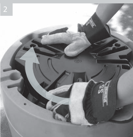
Turn bin body over insert ballast cartridge into recess and twist clockwise to lock locking mechanism is described in steps 8 and 9