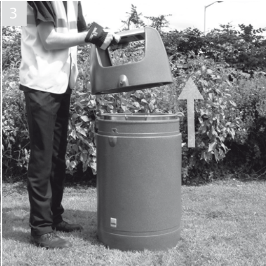
Lift top upwards and off bin body

Viscount litter bins can be supplied with either a plastic liner or as sack retention