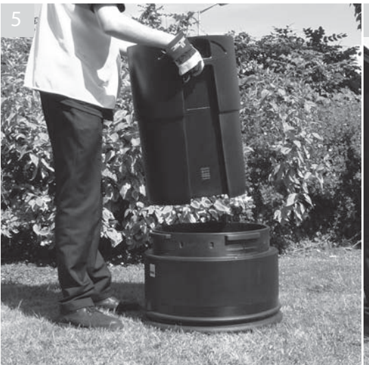
Lift liner upwards clearing the bin base and empty