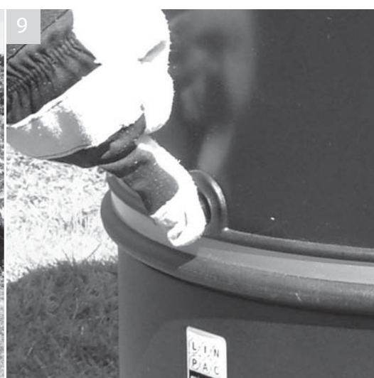
Push lock in to engage