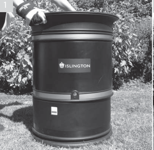
The open top round heritage connects and releases from the base in the same way as the Round heritage