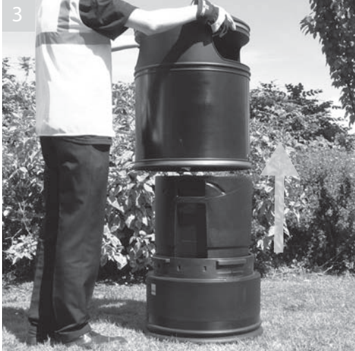
Lift the hood upwards clearing the bin liner, place on ground

Round heritage litter bins can be supplied with either plastic or metal liners