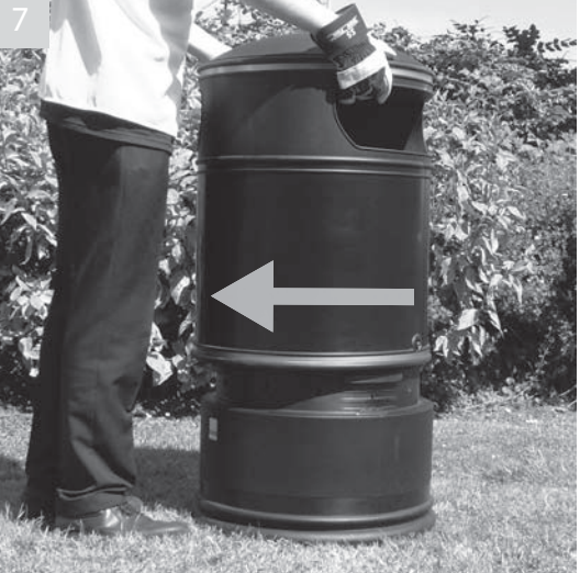
Replace hood and twist clockwise until it drops to its lowest point on base