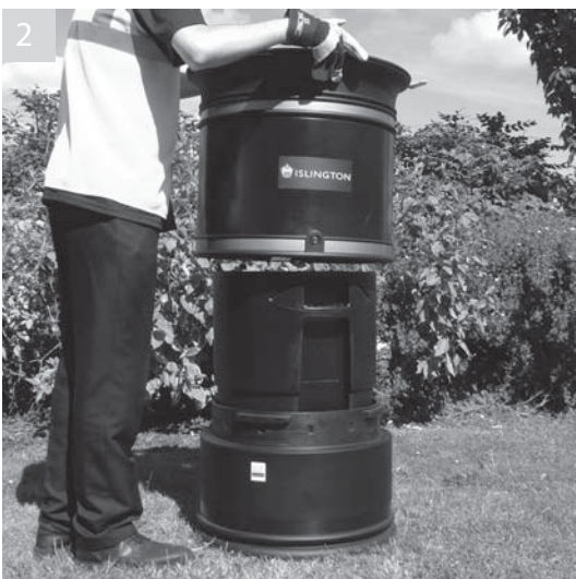
Lift hood using rim to grip. Remove and replace liner as with round heritage