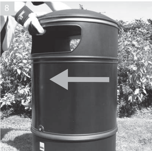
Continue to twist hood clockwise until it will rotate no further