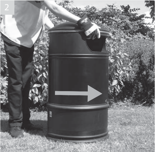
Gripping bin apertures twist hood anticlockwise until stop