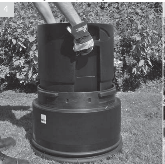
Grip liner using the two handles