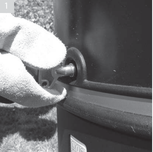
Insert key and turn clockwise until stop. Lock will pop out and release