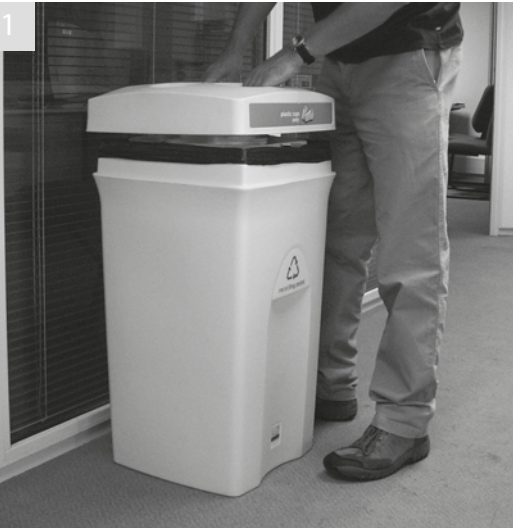
1 Grip hood and lift upwards and clear bin body