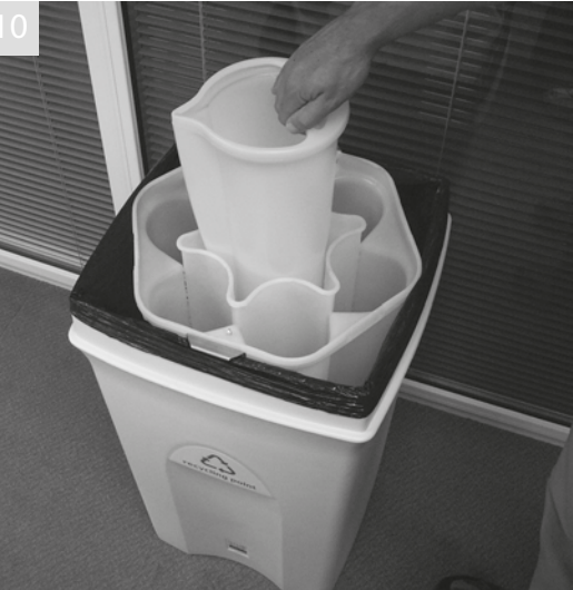
Replace excess liquid reservoir into central core