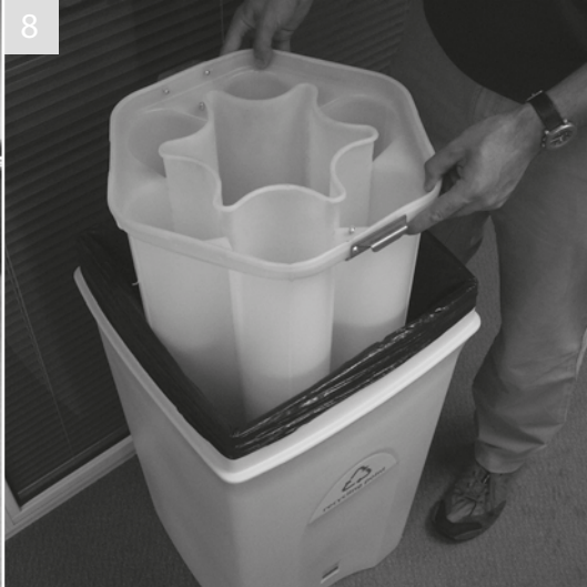
Replace cup holder orientate so that metal clips align with the front and back of the bin