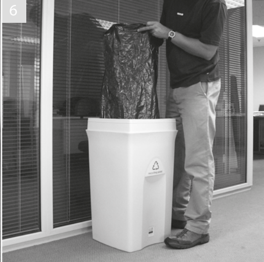
Gather liner and remove