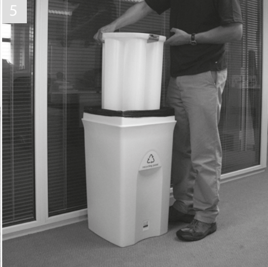
Lift cup holder upward clearing bin body. Cups will remain in the sack