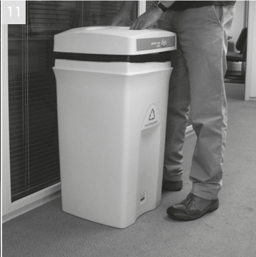
Replace hood so that label faces the front of the bin and lines up with any logos or personalisation