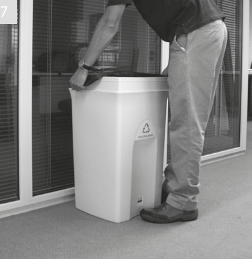
Stretch liner over the bin body and push down into the bin