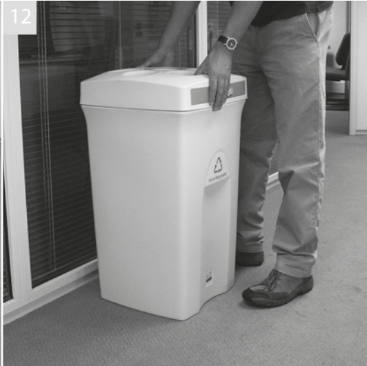
Push down ensuring the hood is seated at its lowest position