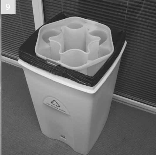
Drop cup holder down to its lowest level so that the front and rear clips hook over the bin edge