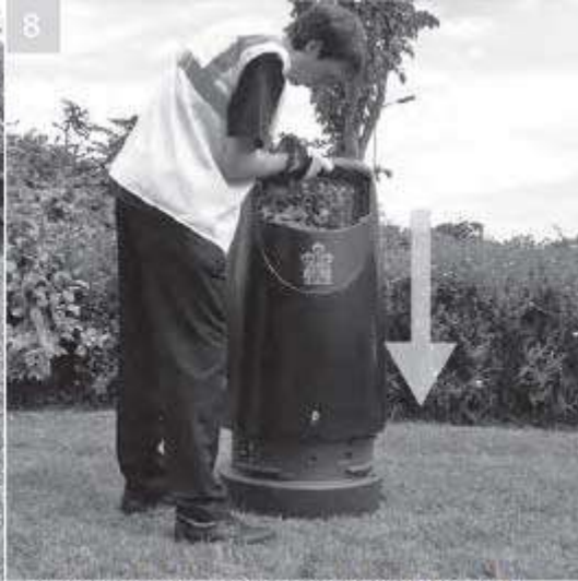
Replace hood positioning over liner and lower onto base