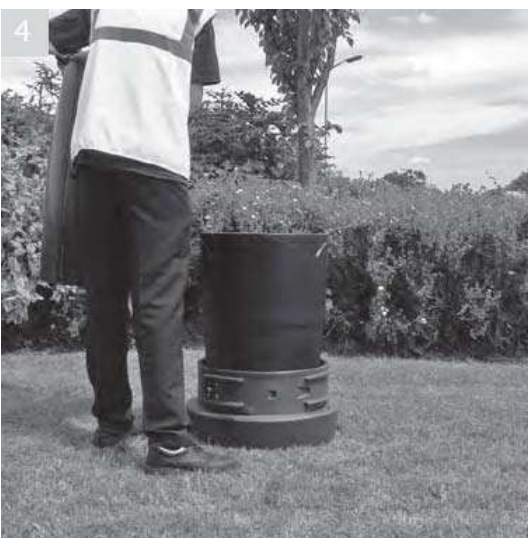
Place hood onto ground