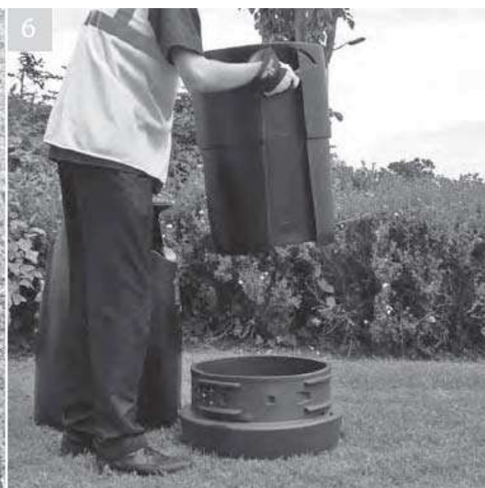
Lift liner up and over base and empty