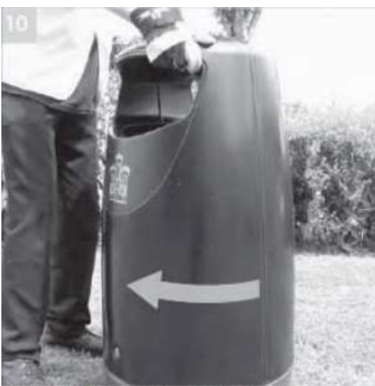
With bin hood resting on base, twist hood clockwise