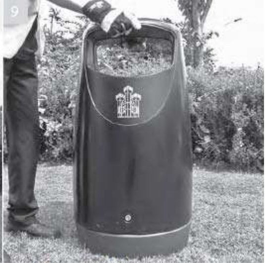
Twist hood until it drops to lowest position