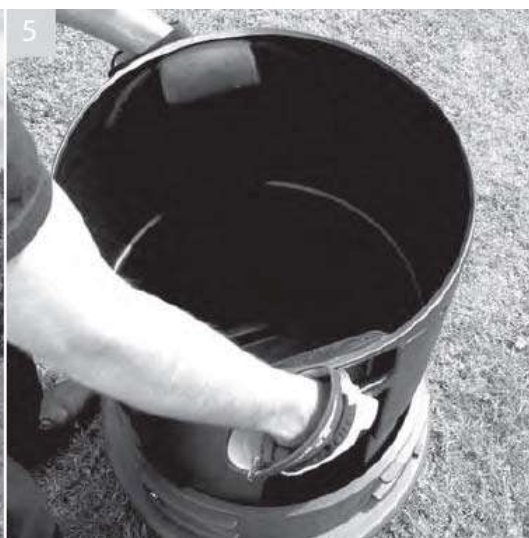
Using the two handles grip liner