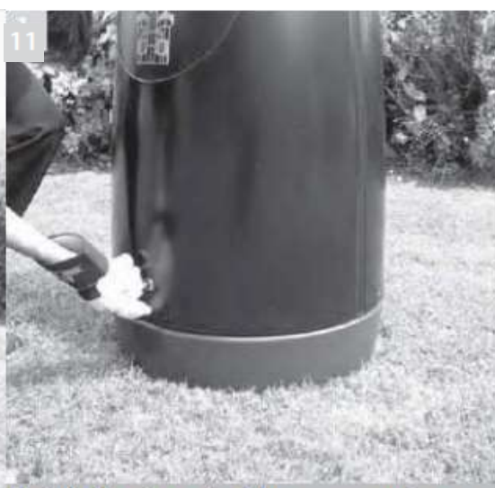
Push in the plunge lock to engage and secure the lid.