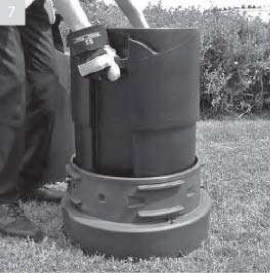
Relocate liner into base