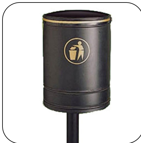
Product Code: MESWNIOP

The Nickleby litter bin is available in two versions and features an attractive, Victorian style appearance and is available in a choice of three standard colours, each with a decorative gold band around the circumference of the bin.