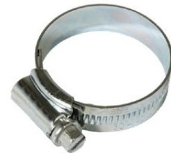
Optional Jubilee Clips