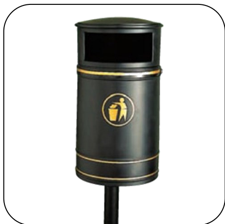
Product Code: MESWNICKLEBY