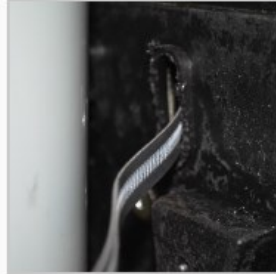
2] Thread Jubilee clip through one hole.