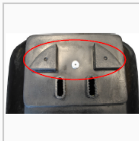
1] Locate holes at back of bin.