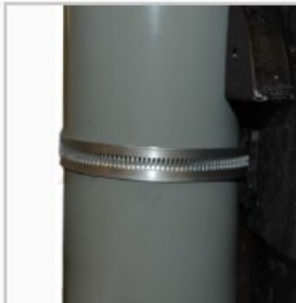
5] Tighten using Screwdriver.