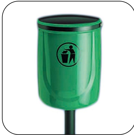
Product Code: MESWOSPOP