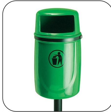
Product Code: MESWOSPRED

The Osprey litter bin is available in two versions and features an attractive design.