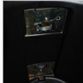
3] Thread through second hole.