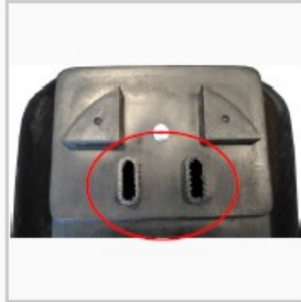
1] Locate holes at back of bin.