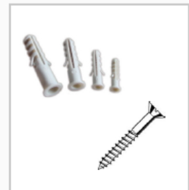
Plugs & Screws not supplied.