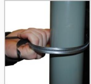
4] Wrap around post.