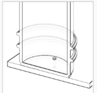
4] Secure the Bin to the Base using 3 bolts. Place liner into bin to cover over fixing.